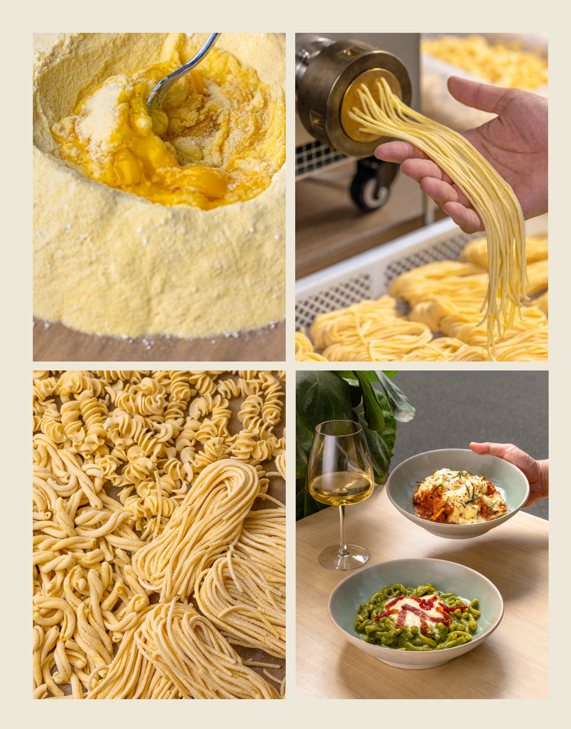
Fresh pasta is made in-store throughout the week using local eggs laid by cage-free and hormone-free hens. We use a special bronze pasta extruder, which we've nicknamed "Monty" to produce our chitarra spaghetti and caserecce.